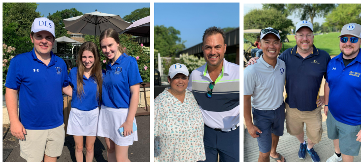
Left: Members of the DLS Golf Team